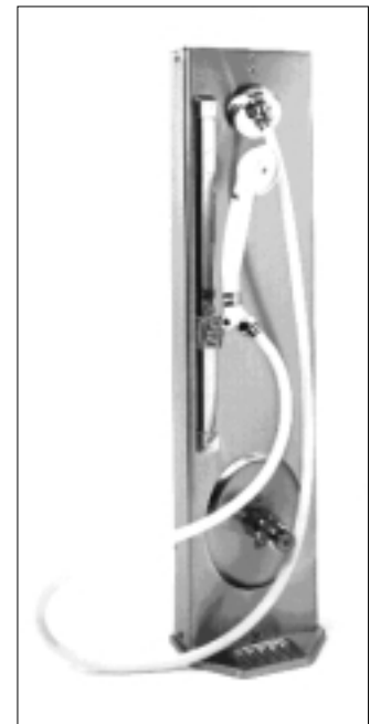
Hydropanel II Model 450-4004M with Handshower Assembly and Soapdish