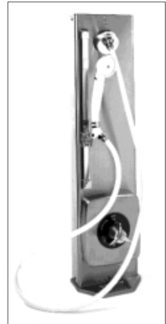
Hydropanel II Model 450-0414 with Handshower Assembly and Soapdish (available with ADA complaint lever handle Model 450-0420).