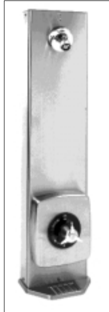
Hydropanel II Model 450-0412 with Swivel Showerhead and Soapdish (available with ADA complaint lever handle, Model 450-0418).