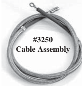
#3250 Cable Assembly